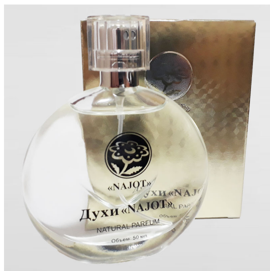
Women's Perfume «NAJOT»