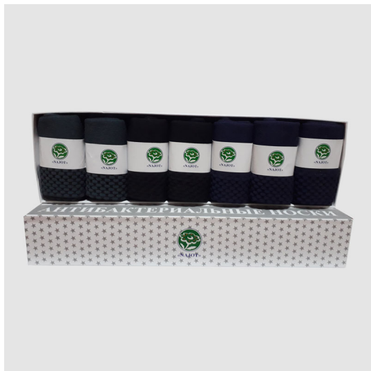
Antibacterial socks «NAJOT»