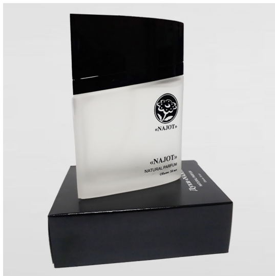
Men's Perfume «NAJOT»