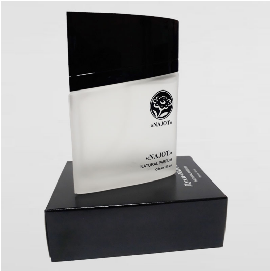
Men's Perfume «NAJOT»